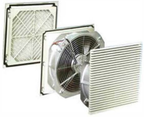
Figure 2: Typical louvered fan guard and fan with snap-on guard.