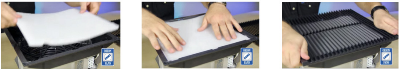
Figure 4: Replacing the filter for a standard snap-on louvered fan guard.

Once the louvered guard and the old filter have been removed, the filter is replaced as shown in Figure 4 for a standard snap-on louvered fan guard. First, lay a new filter in the enclosure. Second, smooth out the filter, making sure it is correctly positioned and centered. Finally, replace the louvered guard. The procedure is similar for the slide and hinged louvered guards.