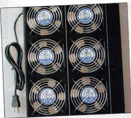
Fan trays provide intelligent control and feedback options that maximize energy conservation and improve performance